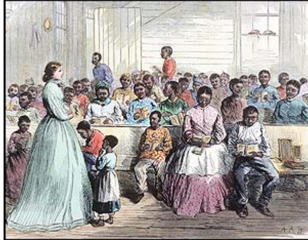
This primary school in Vicksburg, Mississippi was opened by the Freedman's Bureau.

To help the slaves freed by the 13th Amendment, Congress established the Freedmen's Bureau in 1865 to help former slaves resettle into life. Despite its accomplishments, the Freedmen's Bureau did not solve the serious economic problems of black Americans. Most continued to live in poverty. They also suffered from racist threats and laws limiting their freedom and civil rights.