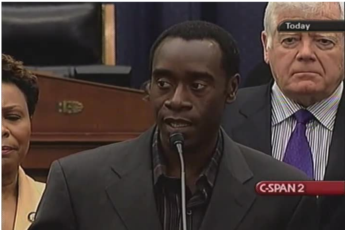
Figure 5: Still of Don Cheadle from Capitol Hill Press Conference on Darfur