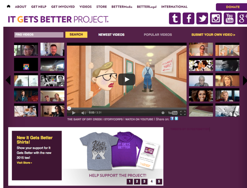
Figure 15: Screenshot of the It Gets Better Project website homepage

Instead of relying almost entirely on visual imagery to speak for them like the NOH8 Campaign, the It Gets Better Project has a well-managed and clear articulation of their positioning that is present across all of the content of their website.