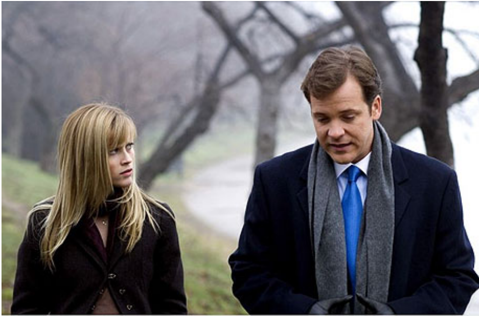
Figure 2: Still of Reese Witherspoon and Peter Sarsgaard in Rendition

In this speech, Smith not only explains to Isabella (and the viewer) what extraordinary rendition is (and therefore what happened to her husband), but places the policy and practice of extraordinary rendition in its real-life historical and political context.