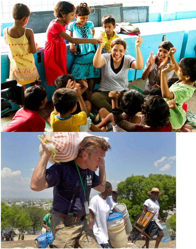
Figure 8: Juxtaposition of America Ferrera playing with Sean Penn working

While such visual rhetoric is not exclusively gendered in this way—female celebrities are shown in serious conversation and male celebrities are shown with children, for example—this tends to generally be the case. This is perhaps because ‘appropriately gendered’ imagery provides intelligibility to humanitarian work—which quite often occurs in foreign contexts—by presenting us with a recognizable point of entry. Suggestive of cultural universalisms—in so much as what it ‘means’ to be male or female transcends cultural differences—appropriately gendered imagery makes the foreign familiar. Ariella Azoulay believes that photographic statements depend on the recognition of the spectator to gain meaning, serving as a call to action for the citizen