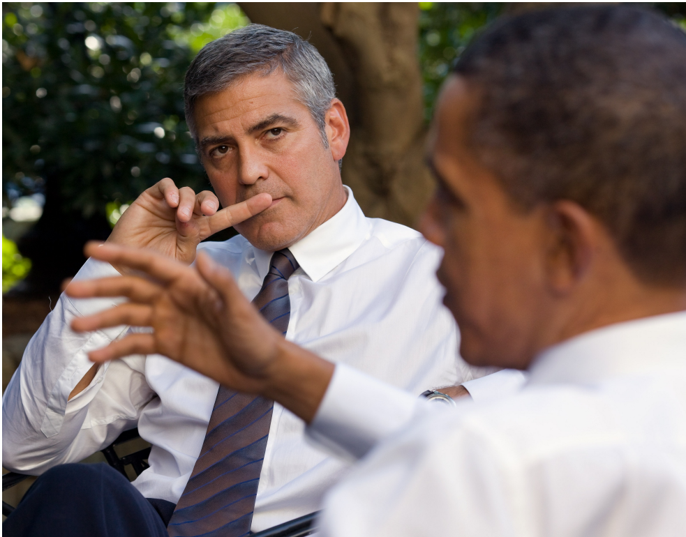
Figure 9: George Clooney and President Obama meet at the White House in 2010 to discuss Darfur

because we see the symbols of crisis or atrocity (such as starving children or crying women) but because we see that the celebrity cares.