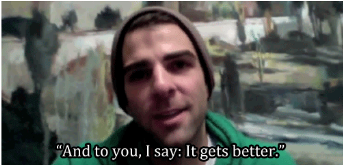
Figure 12: Still from actor Zachary Quinto's "It Gets Better" video

Thus in later interviews, such as one conducted by The Hollywood Reporter in February 2012, while still maintaining that the most important video contributions were those made by the “tens of thousands average queer people,” Savage slightly rearticulated his position on the potential benefit of celebrity involvement: