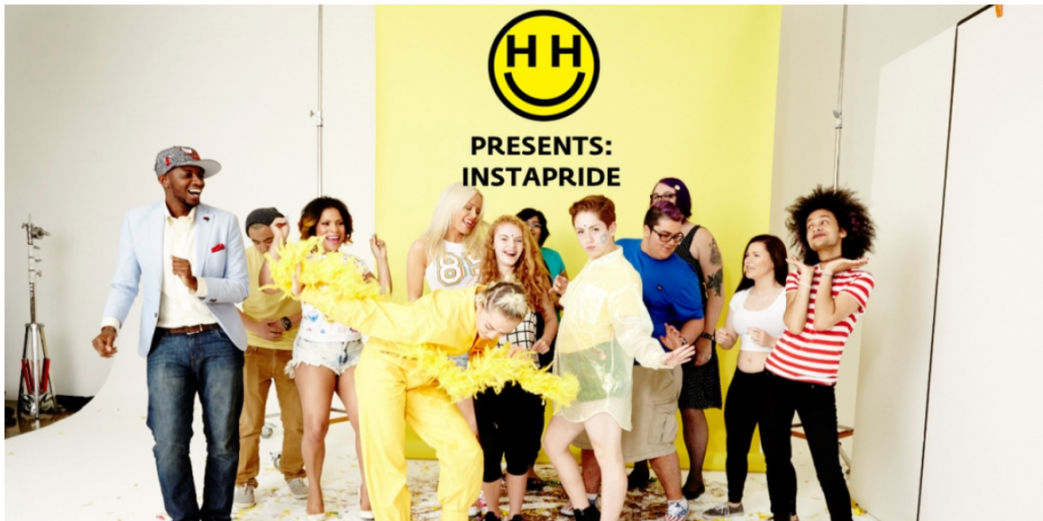
Figure 17: Group photo from the HHF's #InstaPride campaign

the HHF website, the #InstaPride campaign is “celebrating love, support, and resilience with portraits of transgender and gender expansive individuals from all walks of life,” in order to “help increase acceptance, inspire others for a positive future, and confront the stigma and misconceptions around gender.” 663 This celebration of transgender and gender expansive individuals is framed as a concrete connection between the individual happy hippie and happy hippies as a group: by consuming images of others tagged with #InstaPride, the viewer will “learn more about the power of acceptance self-expression and freedom, no matter what our gender identity.” 664