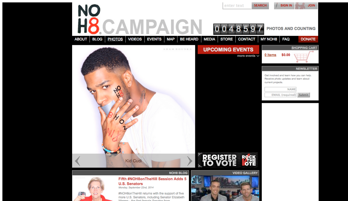
Figure 14: Screenshot of the NOH8 Campaign website homepage

Otherwise, NOH8 relies almost entirely on the average citizen-subject's ability to decode the visual cues in the portraits, including the leet H8 (originally a clever way of equating Proposition 8 with 'hate' for those in California or familiar with the battles surrounding the Proposition, but with the 'hate' aspect being universally decipherable) and the use of duct tape over the mouth to symbolize the act of silencing, as well as their ability to understand these cues as being representative of a collective fight for equality and civil rights. The covering of the mouth, usually with tape, is of course a familiar form of protest, utilized by groups ranging from the anti-abortion organization Bound4LIFE (who cover their mouths with a piece of red tape bearing the word "LIFE" as part of a "silent