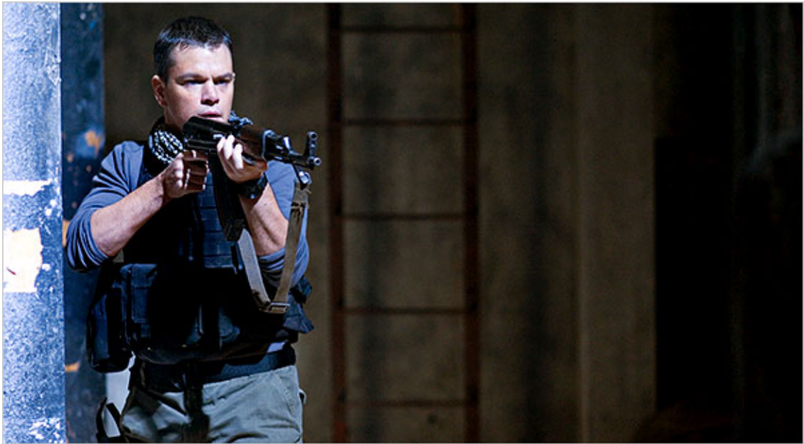
Figure 3: Still of Matt Damon in the Green Zone

Set in Iraq immediately after the US invasion in 2003, the Green Zone tells the story of Chief Warrant Officer Roy Miller (Matt Damon), leader of one of the squads in charge of investigating and eliminating sites that intelligence reports claim to house Weapons of Mass Destruction (WMD). 363 None of the intelligence pans out and higher-level officers and Pentagon officials repeatedly dismiss Miller's suggestion that there may be a problem with the intelligence—the faultiness of the intelligence is confirmed for Miller in a roundabout way by CIA agent Martin Brown (Brendan Gleeson) after a military-intelligence debriefing. 364 Like Miller, Brown might question the intelligence provided