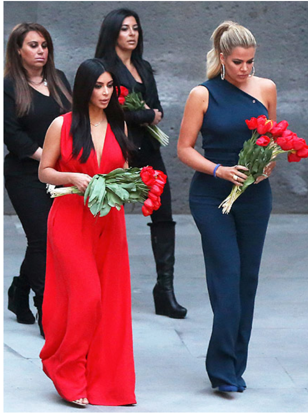
Figure 1: Kim Kardashian-West and Khloe Kardashian visiting a memorial to the Armenian genocide

In an article Kim Kardashian-West wrote for Time magazine about the trip, the reality star called out both Turkey and the American government for not being willing to use the term genocide, writing that: