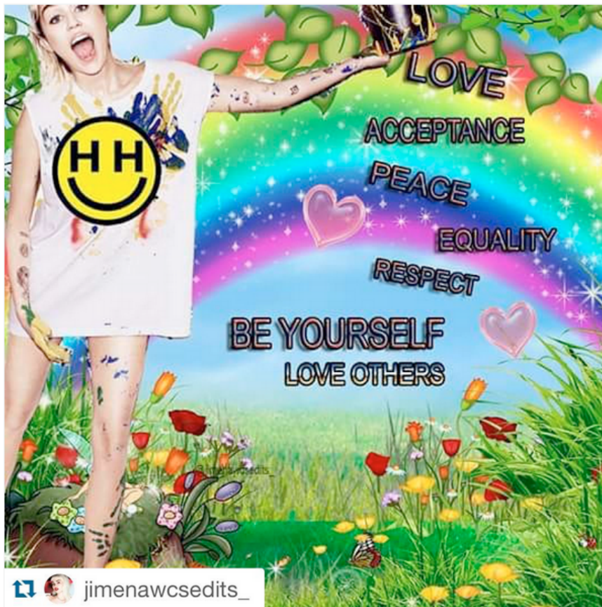
Figure 13: Fan-created image for the HHF that mimics Miley Cyrus' visual brand

And the HHF has been visually and ideologically modeled after the pop star, from the in-your-face neon rainbow palette and bright yellow happy face logo used by the HHF to the “be yourself” ethos that stands in as a sort of organizational mantra, Cyrus clearly serves as a charismatic leader for the HHF as an organization and a model for HHF supporters. As has been noted, the fact that Cyrus serves as a figurehead for the organization makes the HHF different from both NOH8 and It Gets Better, both of which rely on the involvement of celebrities in their various campaigns instead of revolving around a single celebrity.