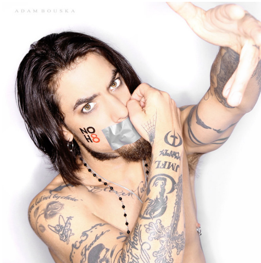
Figure 11: Musician Dave Navarro's NOH8 Campaign photo

To date, roughly 600 celebrities, athletes, public figures, and the like have been photographed as part of the NOH8 Campaign and have appeared in the handful of Public Service Announcements they have produced, including actors and actress such as Josh Hutcherson, Lindsay Lohan, Michael Emerson, and Jane Lynch; musicians such as Mariah Carey, Lady GaGa, Dave Navarro, and 'Weird Al' Yankovic; athletes like Baltimore Ravens player Brendon Ayanbadejo (NFL), Hall of Fame player Isaiah Thomas (NBA), and LA Galaxy player Robbie Rogers (MLS); and public figures like reality television stars Kim, Khloe, and Kourtney Kardashian, former CNN host Larry