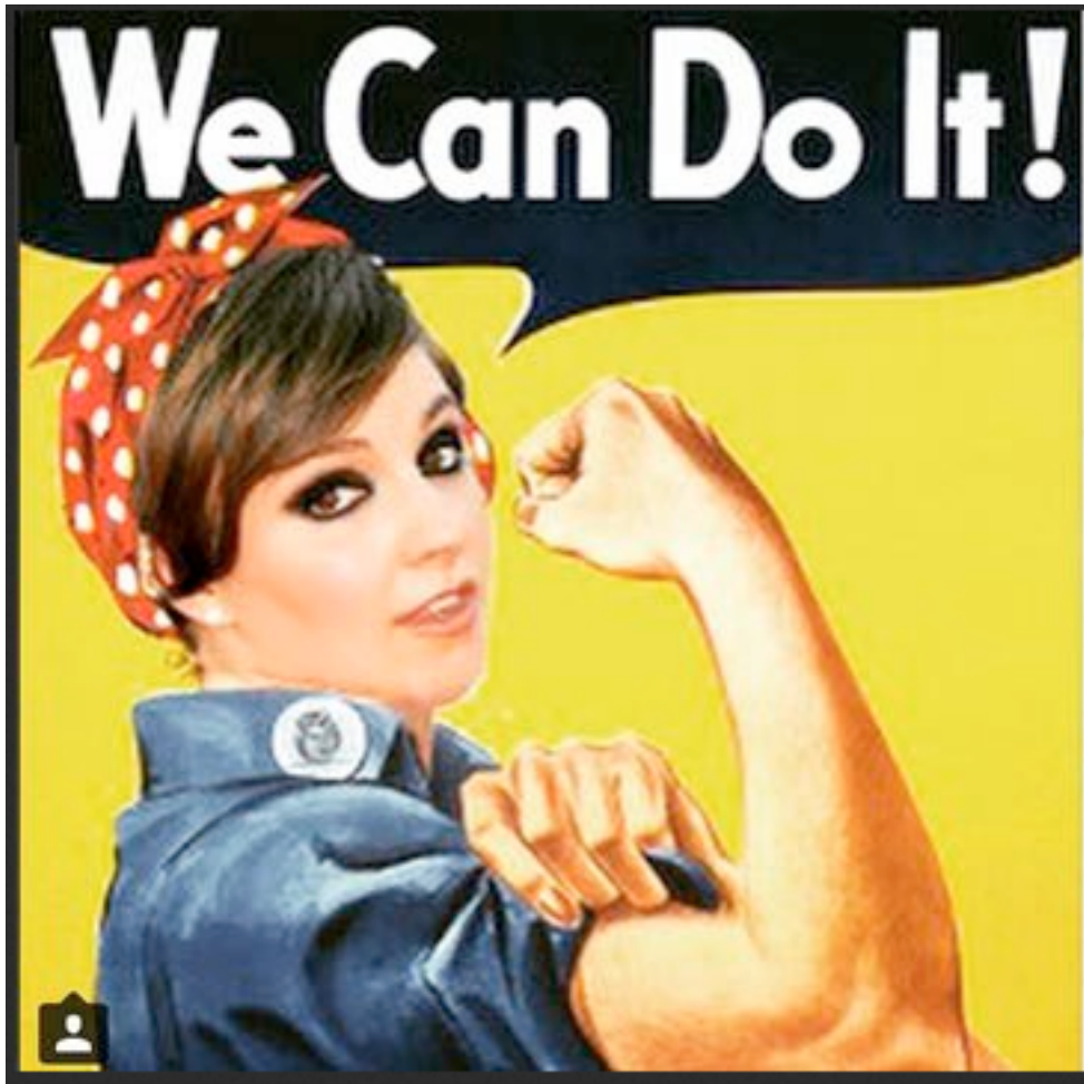
Figure 10: Fan-created image of Lena Dunham as Rosie the Riveter

Fans began using the hashtag #LennyLetter on social media sites to show that they signed up for and support the newsletter and its purpose. #LennyLetter has also been used to tag images of Dunham (including one where Dunham's face has been superimposed over the iconic Rosie the Riveter/"We Can Do It" image) and to denote posts of anything the individual identified as vaguely feminist: ranging from inspirational quotes to images of Solange Knowles to (most bizarrely) multiple posts related to the dentist who shot Cecil