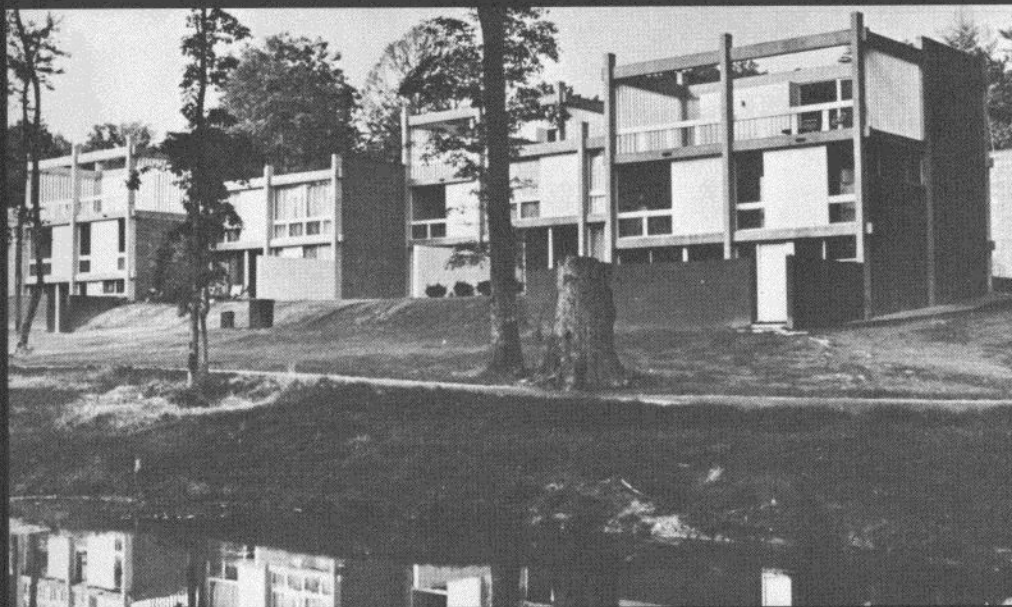
This is the Hickory Cluster at Lake Anne Village with townhouses by Charles M. Goodman Assoc.