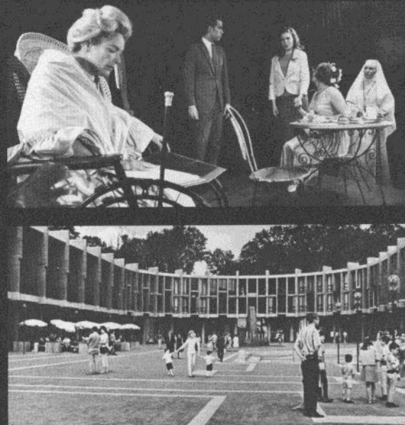
"The cultural aspects are limitless." "You can get away from automobiles."

children have everything available here. They walk to the community center and shop for me, or get their hair cut, or take music lessons." "A mother doesn't have to put a chauffeur's cap on and take her children everywhere." "We wanted everything near and this is the answer to our prayers." "You can walk to the stores."