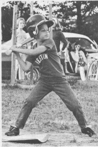
"Reston offers so much for children."