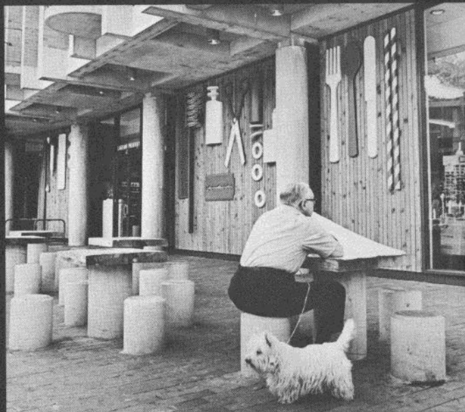
"The people here are the most important factor."