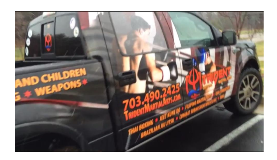
Figure 1 Mobile Billboard

played a role in the school's attempts to recruit and retain students. These methods included introductory specials, family, "refer a friend" and package discounts, and advertising in the form of flyers, business cards, yellow pages and even a "moving billboard" (Figure 1).