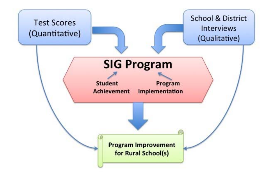
Figure 2. Concept map of complementarity mixed methods

the students' test scores is gleaned from both pieces rather than from either piece on its own. Figure 2 depicts a more general graphical representation of this concept.