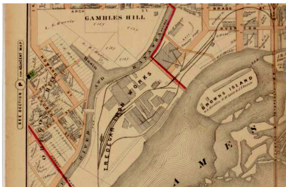
Figure 1. F.W. Beers. Illustrated Atlas of the City of Richmond, Va., Section Q. (Excerpt), 1877. The Beers Atlas shows the late nineteenth century expansion of Tredegar including the spur track of the Richmond and Danville and Richmond and Petersburg Railways across the property. The railroad lines approximately mark the separation between the upper and lower levels of the ironworks that enabled the company to maximize the power obtained from water rights.