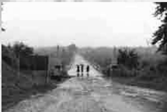
The bridge over the Inguri river.