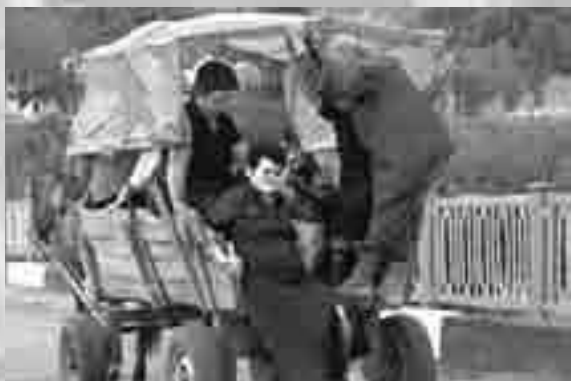
Gali residents cross the Inguri River.