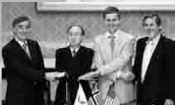
The EU, Japanese, Norwegian and US Co-chairs, May 2006.