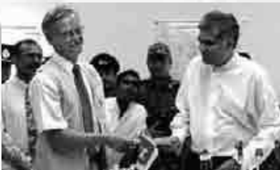
Panil Wickremasinghe (right) formalizing the ceasefire with the LTTE with the Norwegian Ambassador Jon Westbourgh, February 2002.