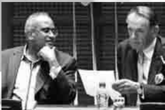
Jan Eliasson (right) with Salim Ahmed Salim, AU Special Envoy for Darfur, October 2007.