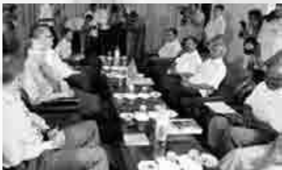
A Norwegian delegation meet LTTE officials in Kilinochchi, northern Sri Lanka, April 2006.