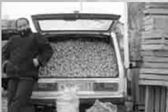
A Russian merchant sells mandarins at the border at Psou.