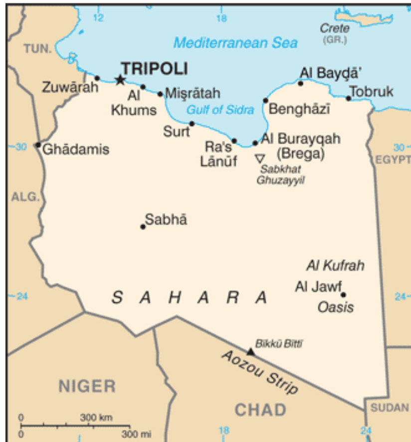
Figure 1 Map of Libya (CIA Factbook)