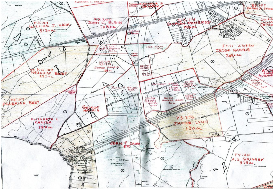
Figure 4 1860 Property Map showing the land holdings of the descendants of slaves freed by Robert Carter, III. Map overlays 1960 property boundaries of the area. 27