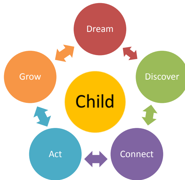
Figure 2. Framework for Child and Systems Advocacy

and families. At this level, leaders join with families to dream and act on different futures for their children. (See figure 2.)